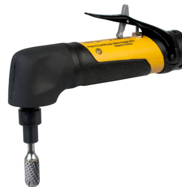
The trigger can easily be repositioned to suit the individual operator.

The LS19-series comes in 5 different models to make it easy for you to choose the right tool for your job. There are three angled models for grinding and sanding and two straight models for die grinding, one standard and one extended. Of course all models feature the same fine tuned vane motor, something you can trust will just keep on going. The same applies to the angle gears in the LSV models, they are built to last.