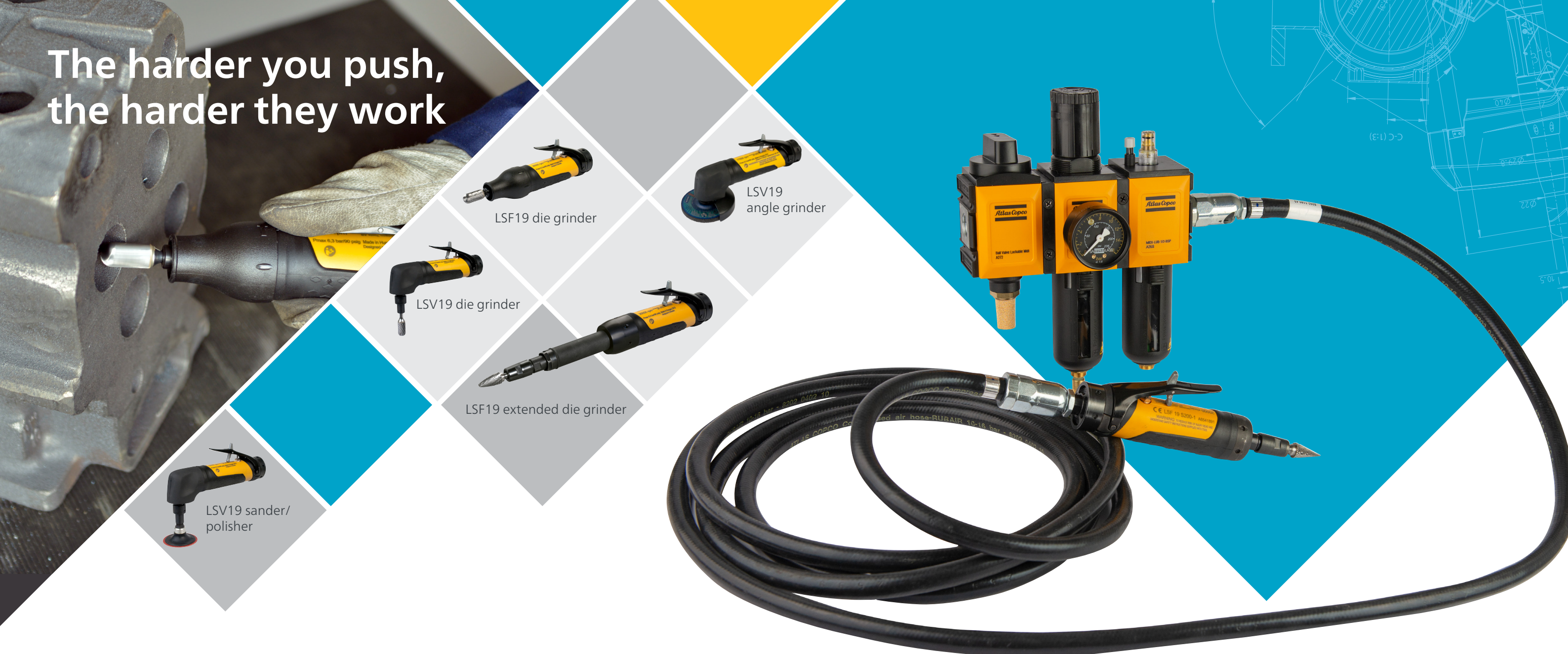
LSF19 die grinder

The harder you push, the harder they work